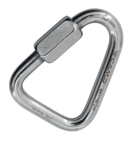
From stainless steel for outdoor installations or corrosive environments.